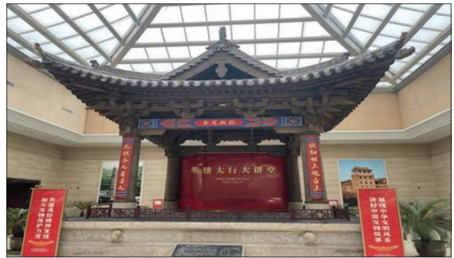
Figure 1. The Ancient Huaibang Opera Stage