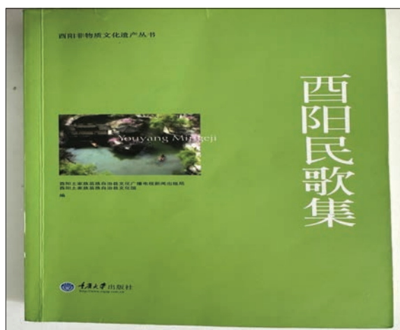
Figure 5. Selected Youyang folk songs

In conclusion, the preservation and transmission of Youyang folk songs require collaborative efforts from multiple stakeholders. Educational institutions play a crucial role in integrating folk songs into curricula, while artistic engagement in rural communities revitalizes vernacular culture. Government initiatives provide policy support and funding for preservation efforts, while publication efforts ensure the availability of resources for inheritance and protection. By leveraging these strategies, Youyang folk songs continue to thrive as an integral part of China's cultural heritage, inspiring pride and identity among its people.