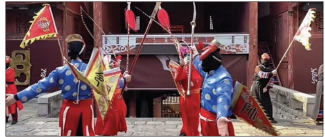
Figure 4. Tima Ancient Song Performed in Gongtan Ancient Town

Nestled in the heart of the Wuling Mountains in Chongqing, Youyang spans an area of 5,173 square kilometers and serves as a vibrant hub for the Tujia and Miao ethnic groups in southeast Chongqing. The region is rich in ethnic cultural resources, housing four national-level intangible cultural heritages and over 200 municipal and county-level intangible cultural heritages. Youyang has earned titles such as