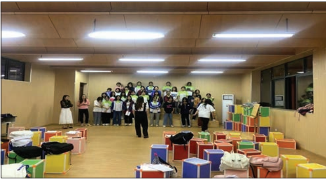
Figure 2. Students' chorus of Youyang folk songs