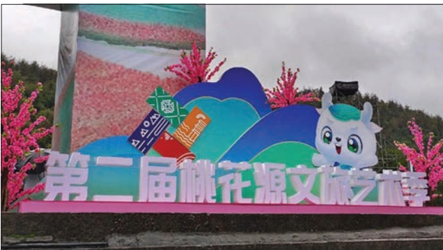
Figure 3. The Opening Ceremony of the Youyang Rural Art Season

Most importantly, this approach regards residents as active participants in the artistic process.