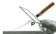
Figure 3: Task 2.

[Task] Design an experimental procedure to answer the following question: In this figure, what factors affect the strength of the electromagnet at point P?