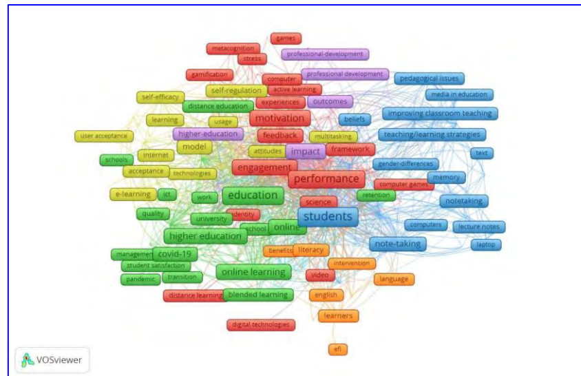
Figure 1: Clustering of Keywords