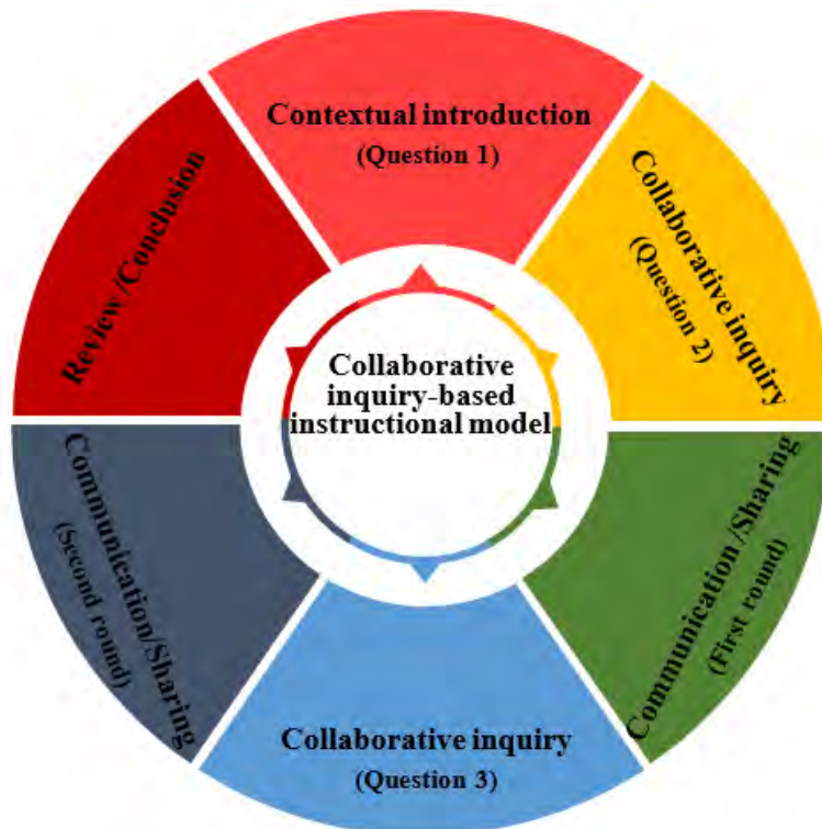
Figure 2. Collaborative inquiry-based instructional model.

Figure 2 illustrates the steps of collaborative inquiry-based learning.