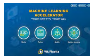
Figure 3 Pixetto online version