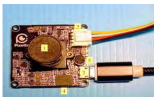
Figure 2 VIA Pixetto visual sensor