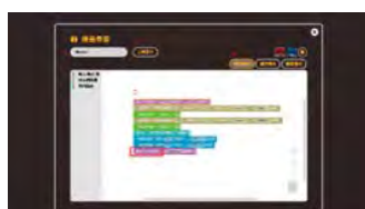
Figure 4 Learning mode