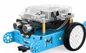
Figure 1 mBot robot