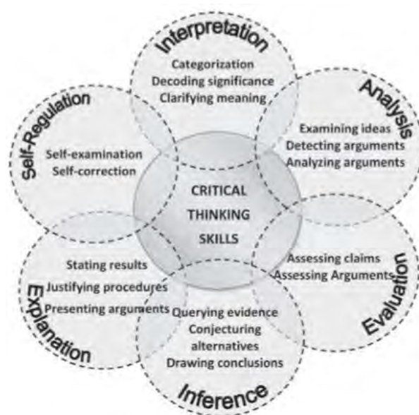
Figure3. Facione's Model of Critical Thinking Skills

Both creative and critical thinking skills are learnable and teachable skills (Anderson et al., 2001). In the 21 st century, the efficacy of universities will be assessed based on their ability to cultivate individuals as critical and creative thinkers capable of generating practical, beneficial, necessary, economically feasible, technologically viable, and justifiable arguments and ideas (AlKhatib, 2019).