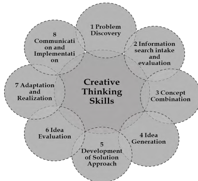
Figure 2: Creative thinking skills model by Schuler & Görlich