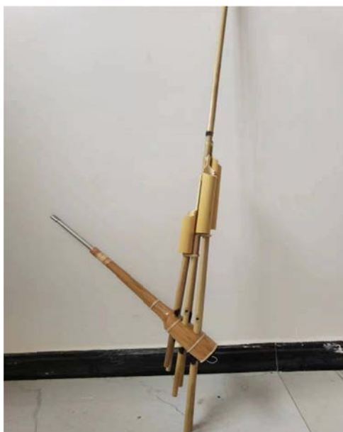
Figure 2. Traditional 6-Pipe Lusheng