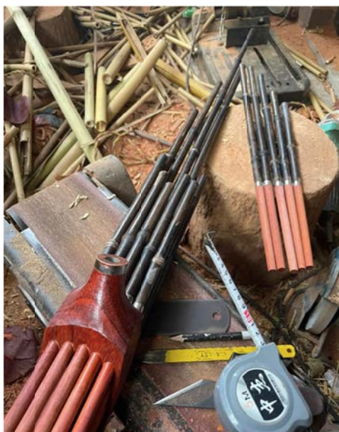
Figure 4. Improved 19-pipe Lusheng