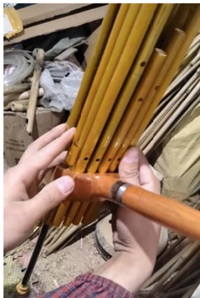
Figure 3. Improved 16-pipe Lusheng

Contemporary Lusheng musicians and practitioners are dedicated to preserving their traditional instrument while adapting it to modern contexts. They focus on passing down their cultural heritage, integrating Lusheng into contemporary music, maintaining and repairing instruments, collaborating with musicians from different cultures, educating the public, addressing sustainability concerns, documenting oral traditions, and navigating the challenges and opportunities of globalization. Their efforts reflect a commitment to both tradition and innovation in the world of Lusheng music.