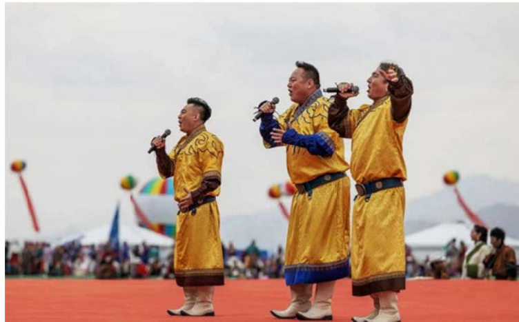
Figure 2. Qinghai Dedu Mongolian folk song singing