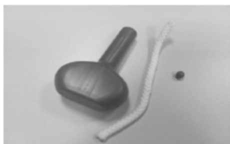
Figure 4: The magical hanging carafe.

The magical hanging carafe. For this activity one skillfully manipulates the frictional force between a pellet and the mouth of a carafe, as well as a pellet and cotton rope (see Figures 4 and 5). This demonstration should be initiated by showing students that the rope cannot hang from the carafe naturally. Next, the rope must be closely wedged between the pellet and the carafe's mouth; this may require one to place the carafe upside down and pull slightly on the rope. At this point, the rope ought to fully support the carafe as it hangs in the air. This trick should be employed during the elaboration stage, and its introduction prompts students to examine their learning outcomes and propose reasonable explanations after learning about the activity's underlying scientific principles.