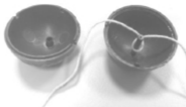
Figure 3: Inside the obedient ball.

The obedient ball. Figures 2 and 3 show the obedient ball and its internals respectively. A cotton thread winds around the reel at the ball's center and then exits. When the thread is pulled straightly (but not tightly), the frictional force is reduced. In this state, the ball's gravity is greater than the frictional force, and consequently falls. Comparatively, when the thread is pulled tightly, the static frictional force between the ball and thread will then be equal to the ball's gravity. As a result, the ball stays affixed to the thread, and appears to follow the performer's instructions. Given that students cannot easily discern how the performer pulled the thread (i.e., whether straightly or tightly), conceptual conflict arises. This trick is included in the elaboration stage, and with its introduction, new questions are proposed to determine whether students' conclusions are consistent with the trick's underlying scientific principles. Students are then encouraged to further explore factors that affect friction and the relationship between frictional and normal forces by pulling the thread tightly.