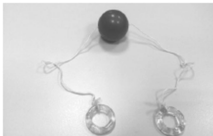
Figure 2: The obedient ball.