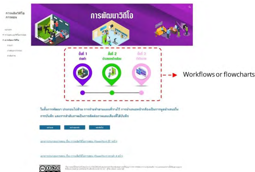
Figure 1. Steps in the process or order of content ( https://sites.google.com/view/instruction-video-production/การพัฒนาวิดีโอ )

Visual graphics are designed to show the steps and how they are connected. Summaries of content make it easier for pre-service teachers to learn and follow as they create their own instructional videos. Pre-service teachers can also evaluate their knowledge and ability as they learn each topic. As shown in Figure 1 , the text blinks to show where pre-service are learning in the lesson.