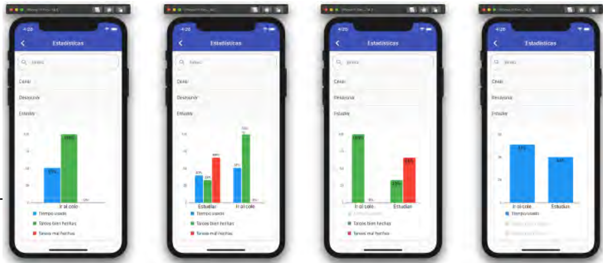
Statistics module of app in project 2

Due to the Covid-19 pandemic, most of the meetings were conducted online, but the student had the opportunity to have two face-to-face meetings with therapists to make a presentation of the app features. Table 6 summarizes this experience using Agile. The project was completed on time and the student was able to defend it in September 2020 obtaining the maxima qualification of 10. In addition, the project was the winner of two awards at our university as the best Bachelor's Thesis in sustainability and development cooperation, and as the best Bachelor's Thesis on ICT.