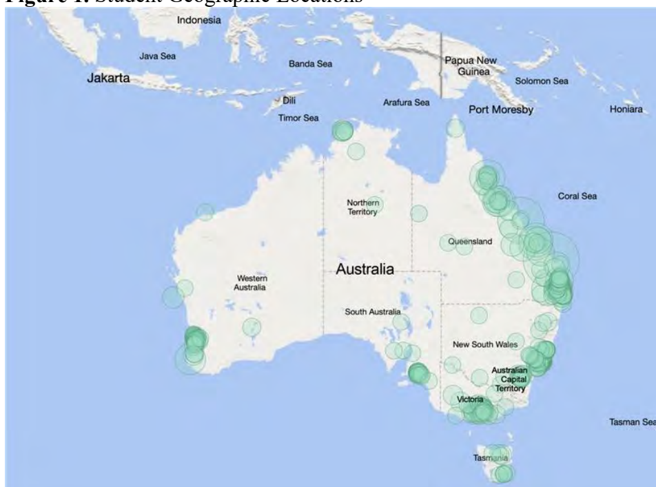
Figure 1. Student Geographic Locations

During the two years of offering, the course was open to Australian domestic students only. Some students in the course were based in highly remote areas, such as Tennant Creek in the Northern Territory and Broken Hill in New South Wales. Figure 1 shows the geographical distribution of all students in the course and highlights the regional and remote focus of the course. In some cases, clusters of students were associated with government agency cohort enrollments. Areas such as southwest Western Australia and the Wide Bay region in Queensland are examples of where government departments chose this course as a professional development option for their staff. Four cohorts comprising a total of 31 students were admitted to the course as non-pilot students. Overall, the geographic dispersion of the students shown in Figure 1 indicates the actualization of the design intent to focus on regional and remote students.