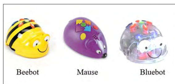
Figure 2. Robots Available in The Market for Early Childhood.