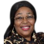
( Corresponding Author)