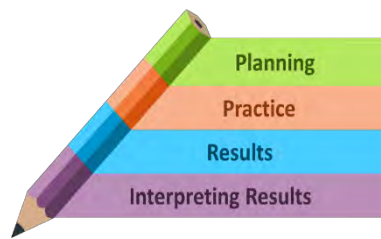
Figure 1. Research Process

The present study utilized a qualitative research method and an action research design. Action research is a systematic research process used by researchers, such as teachers or academics, to examine their practices, observations, and possible directions for a problem or action (Johnson, 2014). The research design-based research process is illustrated in Figure 1.