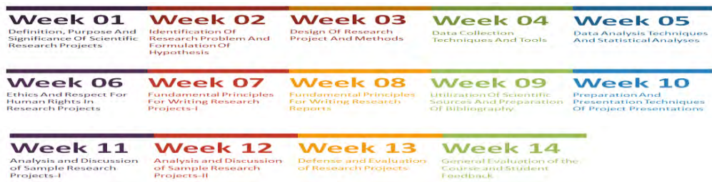
Figure 2. Flow of the Action Plan

The purpose of this action research was to assist science teachers who are pursuing their master's degree in gaining practical experience in preparing a scientific research project, examining their perspectives on the process, and assessing its effects on the participants. The research was conducted in two stages. In the first stage, one of the researchers provided the participants with theoretical knowledge, and sample projects were presented. Figure 2 illustrates the flow of theoretical knowledge provided in this stage.