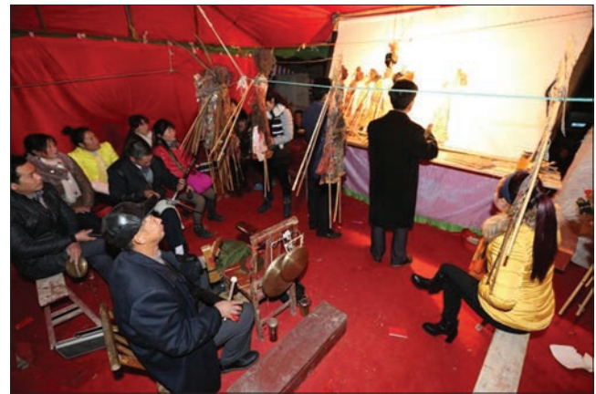
Figure 2. Backstage

Cultural Resilience: Jiang Han Ping Yuan Shadow Puppetry, a folk art handed down through generations, remains popular across urban alleys, mountains, rivers, and plains—a