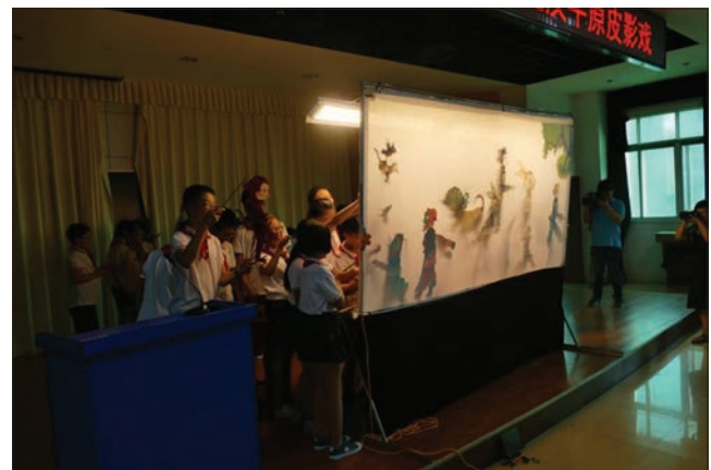
Figure 3. On stage

cherished local play for people of all ages. Despite advancements in contemporary entertainment, shadow puppets continue to be an indispensable cultural and entertainment element in the lives of folk people in Hubei.