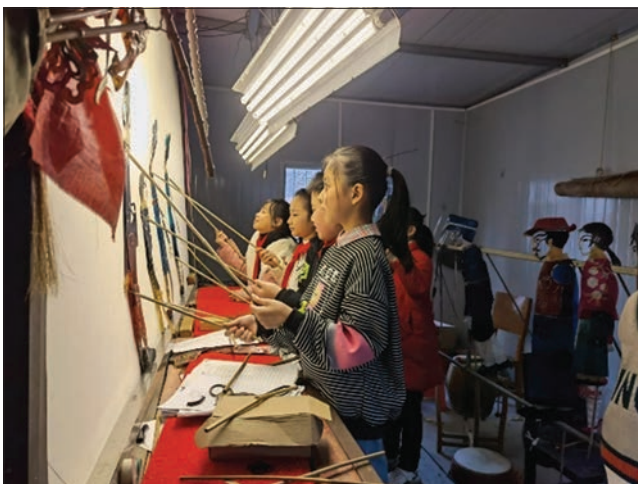
Figure 4. Elementary school students learn shadow puppetry

In light of the findings, the research proposes specific recommendations for curriculum development. This may involve creating standardized modules that seamlessly integrate shadow puppetry into subjects like history, language arts, and performing arts. Furthermore, the research suggests offering professional development opportunities for educators to enhance their ability to incorporate this traditional art form effectively.