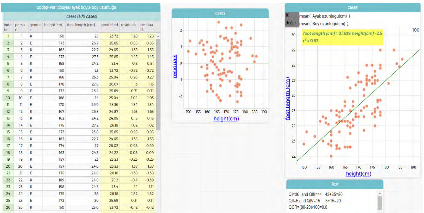
Figure 11. Residual plot and least-squares line

By analyzing the data, they argued that there was a linear correlation between foot length and height and that foot length could be used to predict height and they supported this argument with examples.