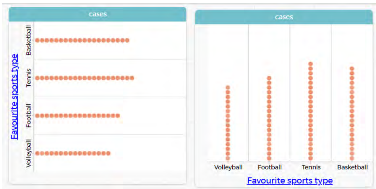
Figure 5. Types of representations used in the task

Based on these collected raw data, the PTs created horizontal and vertical dotplots to represent the data and they also represented the data with a table.