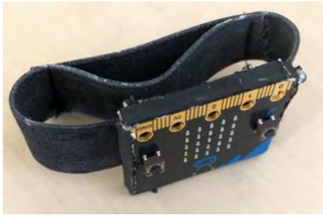
Figure 4. Student-built Pedometer as a bracelet