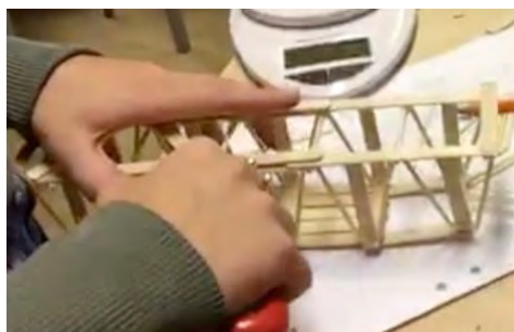
Figure 2: Student optimizing weight of the model by removing material.

In the Greenhouse project models were used for trial and error when building the framework for the greenhouse. The students tried the stability of different framework constructions. The models also were used when testing functions using trial and error. This could be about testing functions such as opening windows or doors automatically when the temperature got too high.