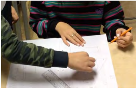
Figure 3. Students discussing by using sketches

The teacher in the Greenhouse project used the opportunity to emphasize and discuss drawings and sketches when introducing the project: