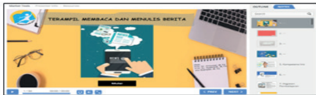
Figure 2. Learning media snippets

After the learning media is designed, then validation is carried out in two ways, namely self-validation and expert validation. The results of the validation can be seen in table 5.