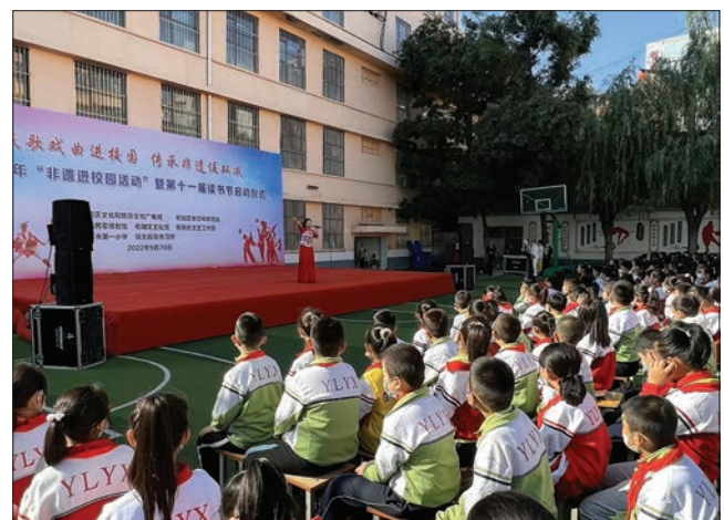
Figure 2. Folk songs into school activities