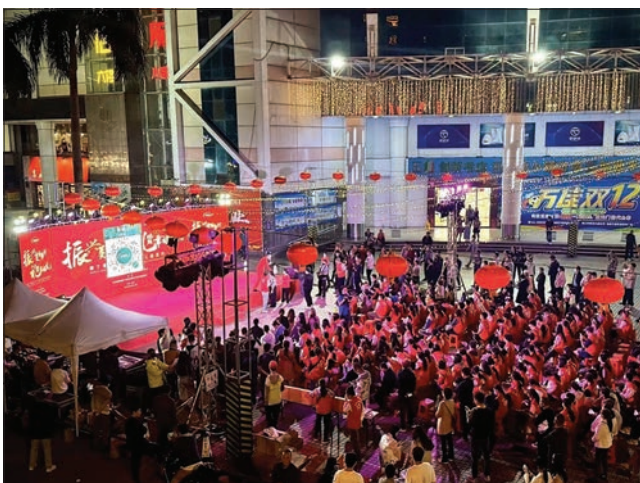
Figure 5. Folk songs through musical and cultural activities

The studies discussed in the previous sections provide a better understanding of the structure and characteristics of northern Shaanxi folk music. The literature review for this study relies on a variety of sources, including academic journals, books, and online resources. In this study, which adopts the qualitative research method, data were collected through observation, interview, and online research. The results of the research show that the folk music in the north of Shaanxi is an important cultural heritage of our country and has its own characteristics and qualities, unlike other music genres. This study also demonstrates the importance of developing and preserving folk music culture in northern Shaanxi.