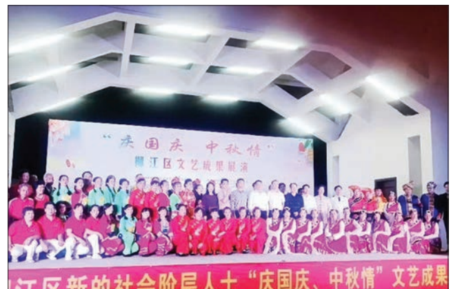
Figure 4. Folk songs through the media