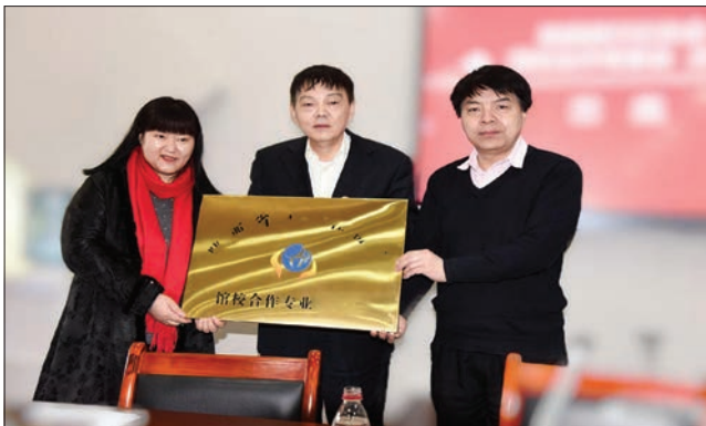
Figure 3. The government has set up relevant protection agencies