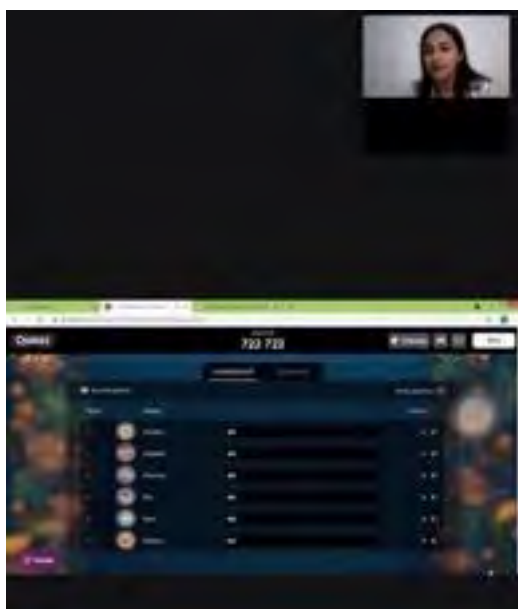
Figure 2. Screenshot from an observation of an online biology lesson

The study utilized online surveys and researcher observations as data collection tools to gather information about the experiences of biology and preschool teachers, as well as student teachers. Researcher observation notes were collected during the teaching practicum course in the spring term of 2020-2021, while online surveys were conducted at the end of the term. Both biology teachers and preschool teachers delivered their teaching through Zoom, and researchers observed each student teacher for four sessions, each lasting 40 minutes. Figure 2 presents a screenshot from an observation of an online biology lesson.