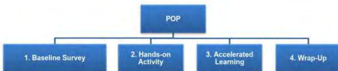
Figure 4: Four stages of POP

Step 1. The first stage is known as Warm-Up/Teaser Test/Baseline Survey . At this stage, teachers challenge students with a question that is relevant to the topic. Students need encouragement to guess the lesson they are going to learn with the help of the baseline survey. This sort of challenging teaser test helps teachers analyse the level of their previous knowledge. Students are permitted to use notebooks or slates. If the question has options, teachers can adopt strategies such as yes-no response, clap up or down, stand up or sit down, show black side or white side of paper , etc. depending upon teachers' convenience and students interest. Here, teacher checks students' previous knowledge of the lesson he or she intends to teach. After doing this test, teacher can conclude what percentage of students has good knowledge. Teacher will keep record like 20%, 40%, 60% or 80%. If students' understanding of the first stage is less than 60%, the teacher has to do at least 3 activities to give students a very clear concept of the chapter he or she has planned to teach. So, this stage is very crucial.