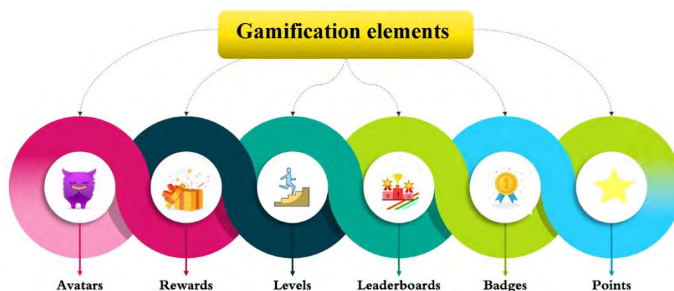
Figure 1. Gamification elements used in the study.

Avatars: This is a visual representation of the learner's character within the game. It aims to increase social engagement by allowing each student to adopt new identities and roles and make crucial decisions within the game from an unfamiliar point of view (Oxford Analytica, 2016). Some gamification applications allow users to create a profile with academic achievements to share with other students and the external community (Oxford Analytica, 2016).