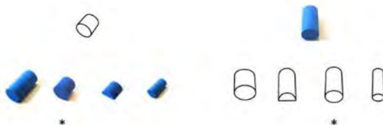
Figure 1. Example of diagrammatic representation test questions.

The diagrammatic representation test used in this study consisted of 24 questions and was originally developed by Frick and Newcombe (2015) for the 4-8 age group. The test assesses students' ability to manipulate and understand visual-spatial information and includes geometric objects, geometric objects with straight black lines drawn on their edges, and color photographs of the drawings created by following the borders. The test is designed as horizontally aligned, four-choice cards centered at the top of the letter-size sheet (four lines of 21.6 cm) presented in the horizontal orientation. In this study, the test was administered to the students in its original form (Figure 1).