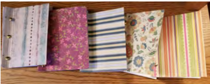
Figure 3. Brad Books created by adult learners

Students start by folding the two sheets of white paper in half longways and then again the short way to create four equal sections. They cut on these creases to create eight separate pages (four from each piece of paper). After cutting all the pages, students select a piece of colorful patterned paper and cut it to create a cover for the front and back. Once the pages and front and back covers have been assembled, they use the hole-punch to punch holes along one side and use brads to secure (see Figure 3). This book type allows learners to decide how many pages they need and how much they will write on each