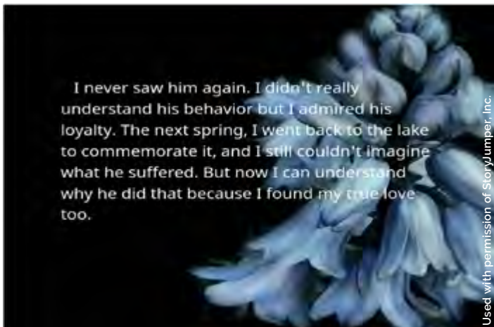
Figure 4. Page of an e-book created by two IEP students

paper. The inside pages can be pre-cut by the instructor, if desired, so that the student only has to choose a cover, punch the holes, and attach the brads. A Brad Book is suitable for all task types in Table 1.