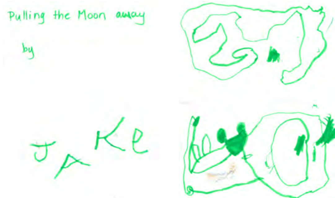
Figure 1. Front cover and inside picture of a Card Book created by a four-year-old

Some task types might initially seem most suitable when reading fiction (e.g., retell the story from a different character's perspective) and others when reading nonfiction (e.g., present further research-informed historical facts about a person, place, event, or idea that was mentioned in the text). Nonetheless, instructors can mix task types with different genres (e.g., retell a book on planets in the solar system from the perspective of Mars for eight-year-old children; present information or create a short guidebook on a city featured in a short story for adults living near that city).