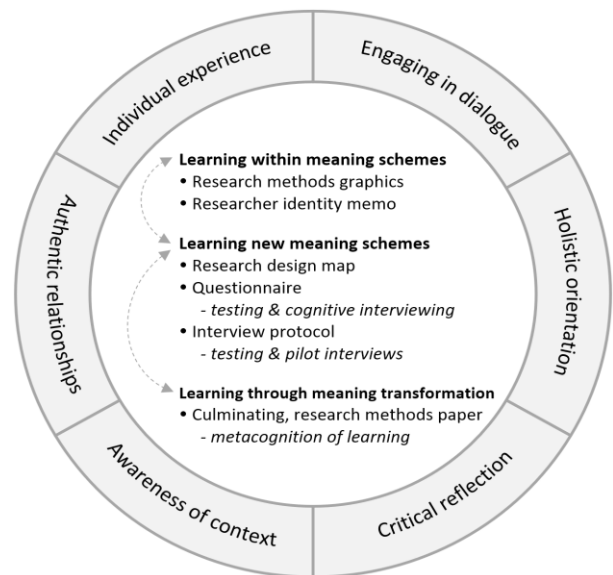
Figure 2. A Comprehensive Transformative Learning Model for EdD Research Methods Courses

When choosing a transformative learning framework to guide the redesign of an EdD research methods course, Taylor's (2009) six core elements provide an excellent structure for a transformative approach for teaching, yet this framework does not fully encompass Mezirow's (2000) transformative learning dimensions of cognition, meaning schemes, and levels of learning. In turn, while Mezirow's (2002) three ways of learning add deeper meaning dimensions, they are not sufficient as a stand-alone framework as they lack the practical scaffolding for teaching that is provided by Taylor's (2009) six elements. Neither framework alone provides a complete model to fully implement the constructs of transformative learning, however, when integrating the unique strengths of Mezirow's (2002) ways of learning with Taylor's (2009) core elements, the result is a comprehensive model of transformative learning (see Figure 2). The use of this combined transformative learning model that provides both structure and a guide for deeper meta-cognitive learning is a helpful tool for the reinvention of EdD research methods courses, as explained in more detail in the next section.