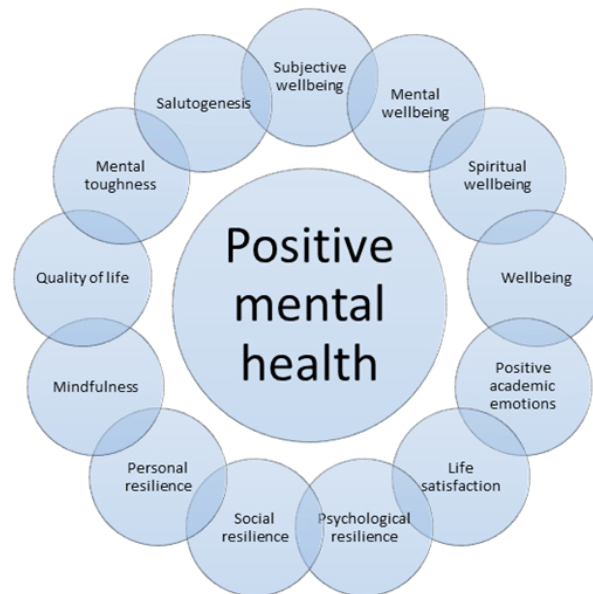
Figure 2: Dimensions of Positive Mental Health Included in the Studies