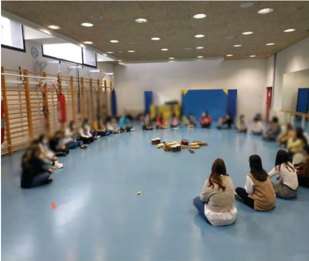
The Instruments activity

Note. Source: Own work (100:1 - PR. 2, S. 2)