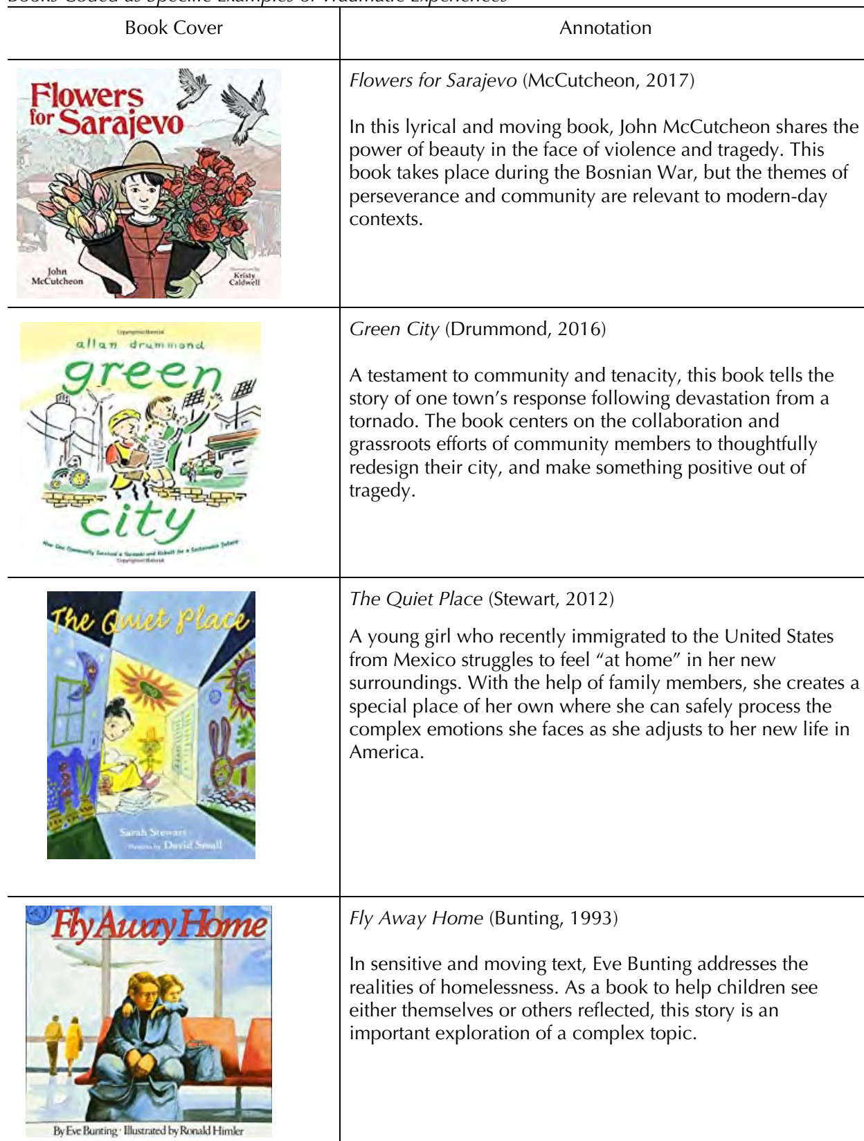
Table 1 Books Coded as Specific Examples of Traumatic Experiences