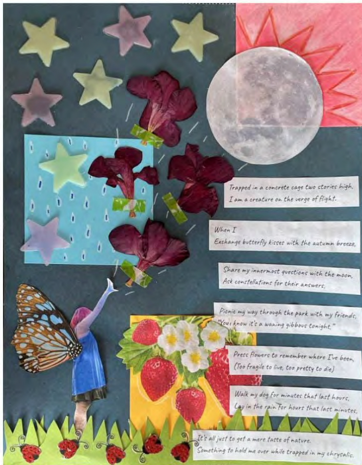
Fig. 4: Trapped in a concrete cage by student B.

In Figure 4, Student B created a physical collage, rather than a digital one, and included flower petals and cut paper. In addition, they added hyperlinks to the pink- and blue-shaded boxes. These hyperlinks anchor to visuals rather than words and lead the viewer to different online sonic experiences including the sound of falling rain. Other students' hyperlinks accessed art songs, poems, TikTok, and visuals. See Figure 4.