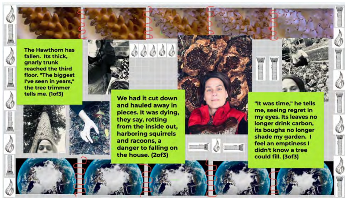
Fig. 1: The Hawthorn has fallen.

Drawing upon the collaborative potentials of shared composing spaces such as Padlet, Zoom, and Jamboard, Candance and Steve crafted a video writing prompt, combining selfie-inspired visual collage and poetry writing on issues related to the environment. Modeling this process of poetic inquiry, they composed their own selfie-collage poems and workshopped them online prior to creating their video writing prompt. See Figures 1 and 2.