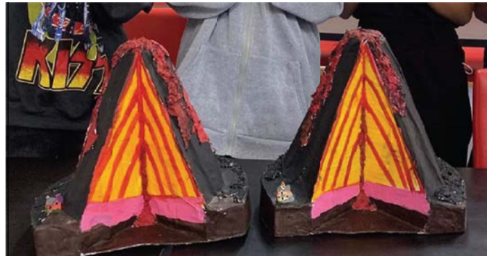
Figure A5. Volcano