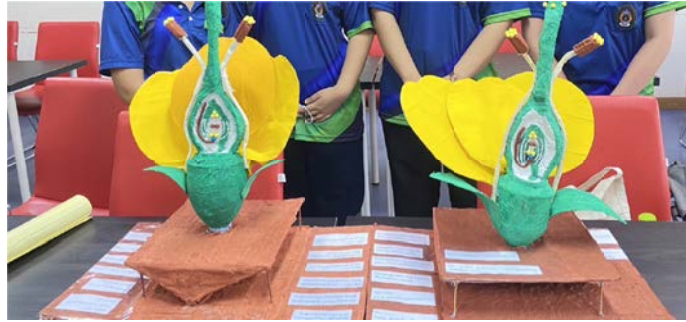
Figure A4. Parts of a Flower