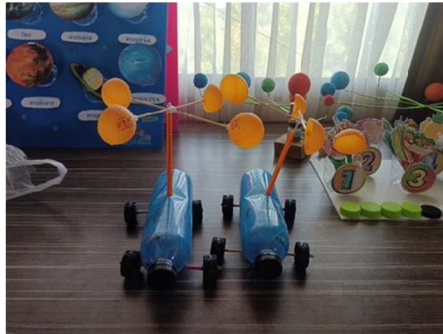
Figure A1. Anemometer