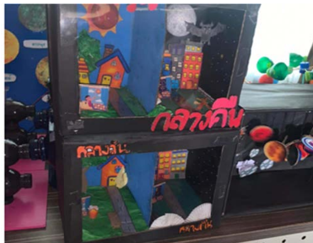
Figure A2. Time box