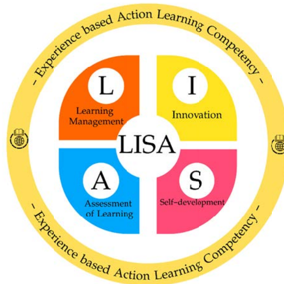
Figure 2. Experience based action learning competency or LISA