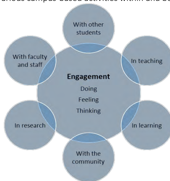
Figure 1. Student engagement model (Burns et al., 2004; Groccia & Hunter, 2012, as cited in Groccia, 2018, p. 15)

This concept of student engagement in the model illustrated in Figure 1 puts forth how learners can be engaged during their academic experience, through teaching and learning, and through research with the community, students, and faculty. Moreover, the model works on three levels, cognitive, affective, and behavioral, upon which student engagement can occur within the specified six dimensions. According to the model, engagement with faculty and staff can be boosted by creating opportunities both in and outside of the class. To enhance engagement with other learners, it is first necessary to help students build community with others in various facilities, such as through learning teams or academic clubs.