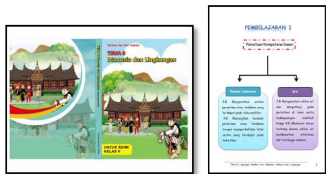
Fig. 2. Early Designs of Pocket Book Based: on Local Genius

At this stage, the authors prepared all the components that will be displayed in the pocket book that will be developed including: designing learning activities, designing materials, designing learning evaluations and designing structures and covers (Figure 2). At this stage, one thing that must be considered is the use of fonts in teaching materials. Font is a complete collection of letters, numbers, symbols, or characters