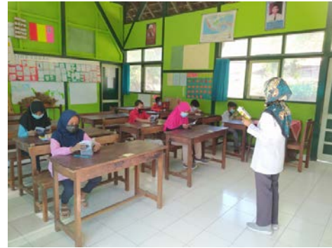
Fig. 4: The Using of Pocket Book at Fifth Grade, Gamping Elementary School

In this implementation stage, the examiner conducted a limited trial with a sample of 7 fifth grade students at Gamping Elementary School (Figure 4). In this study, data were obtained in the form of teacher responses, student responses, and the results of the pretest and posttest scores of fifth grade students in the learning process using a pocket book based on local Genius. In this study, the results of the student response and questionnaire were conducted to determine student responses to the development and learning process using a pocket book based on local genius. The results of this teacher's response were carried out with the aim of knowing the teacher's response to the learning process using pocket book teaching materials based on local genius. The results of the observation of the implementation of the learning process using a pocket book based on local genius aims to determine the teacher's delivery,