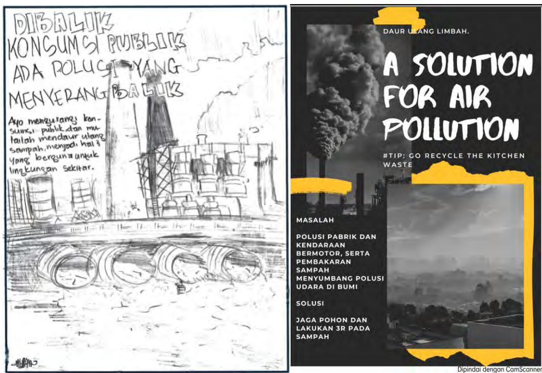
Figure 2. An example of a student poster about air pollution

thinking skills, such as incorporating activities to introduce sustainable living. One example is using digital technology such as the internet, online applications or platforms as a means to facilitate student learning. Digital technology is a positive approach in education for sustainability (Kuntsman & Rattle, 2019). Mobile digital devices as a new portable pedagogical tool have the potential to transform classrooms and enable new ways for students to connect to outdoor environments, empowering their access to different forms of knowledge and experience and enabling location-based learning (Lock & Seele, 2017; Hesselberth, 2018). In addition, online platforms can also be used to test student knowledge, for example with online sustainability literacy tests (Kuntsman & Rattle, 2019).