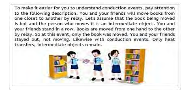
Figure 3. Explanation of conduction with ilutration on the second book page 57

The second book contained illustrations that help to clarify abstract concepts. This book described conduction using a book relay that is transferred from one hand to the other. Only the book moved in this case, but you and your friend did not (p. 57). The concept of convection is explained in the second example. Convection is analogous to moving a book from a cupboard to a table. To carry the book, of course, you move from the cupboard to the table (p. 63). The description was found in the textbook in Figure 3.