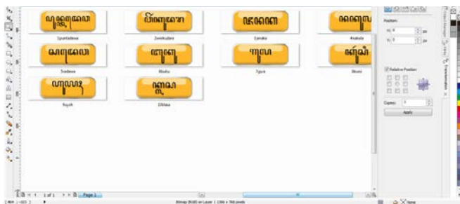
Figure 2: Making Question Answers in CorelDRAW X5 After the Translation Process