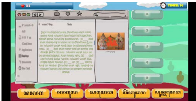
Fig. 1: Questions about the Five Pandavas in the Quiz Game