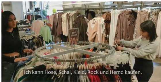
Photograph 1. A screenshot from digital content

As can be seen from the screenshot taken from the digital content above, two friends are looking at clothes in a clothing store, and they talk about the subject such as “ich kann Hose, Schal, Kleid, Rock und Hemd kaufen”.