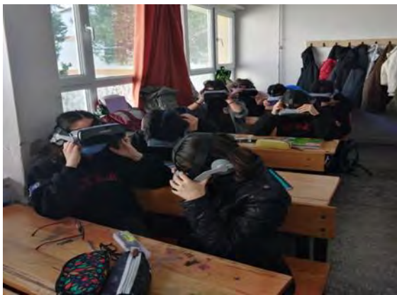
Photograph 3. An image from the application made with virtual glasses

Above is an image of the practice made with virtual glasses in the classroom environment. Students were able to experience the digital content that they could watch in three dimensions, regardless of the environment. Each student wearing virtual glasses had the opportunity to go out of the classroom and take a tour as if they were actually shopping in a shopping mall. Since the teaching process gains individuality after virtual glasses are put on, the possibility of experiencing other undesirable behaviors outside the classroom will be prevented. In this application, every student now has to focus on the content they encounter. Afterwards, a post-test was administered to the participants. Findings related to the study are presented below.