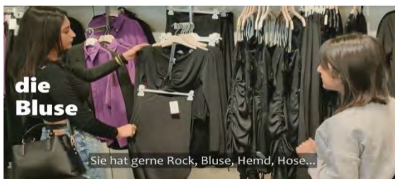
Photograph 2. A section from the shooting of the digital content scenario

As can be seen from the screenshot above, almost all possible life shopping situations in digital content have been animated and the abstract learning inputs have been embodied through the scenario. German expressions and linguistic uses in digital content are both voiced and written. Thus, students were able to experience both the pronunciation and writing of German expressions.