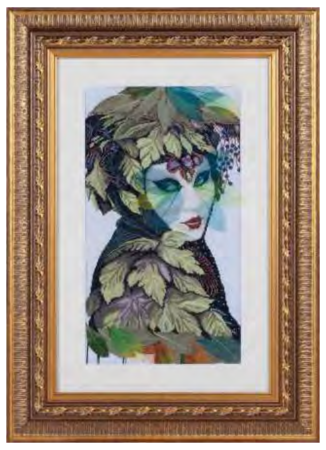
Figure 9: Beverley Hayward, Mocking the Master Narrative: The Masquerade, 2015-19, tapestry and mixed media, 30 x 40 cm, private collection.