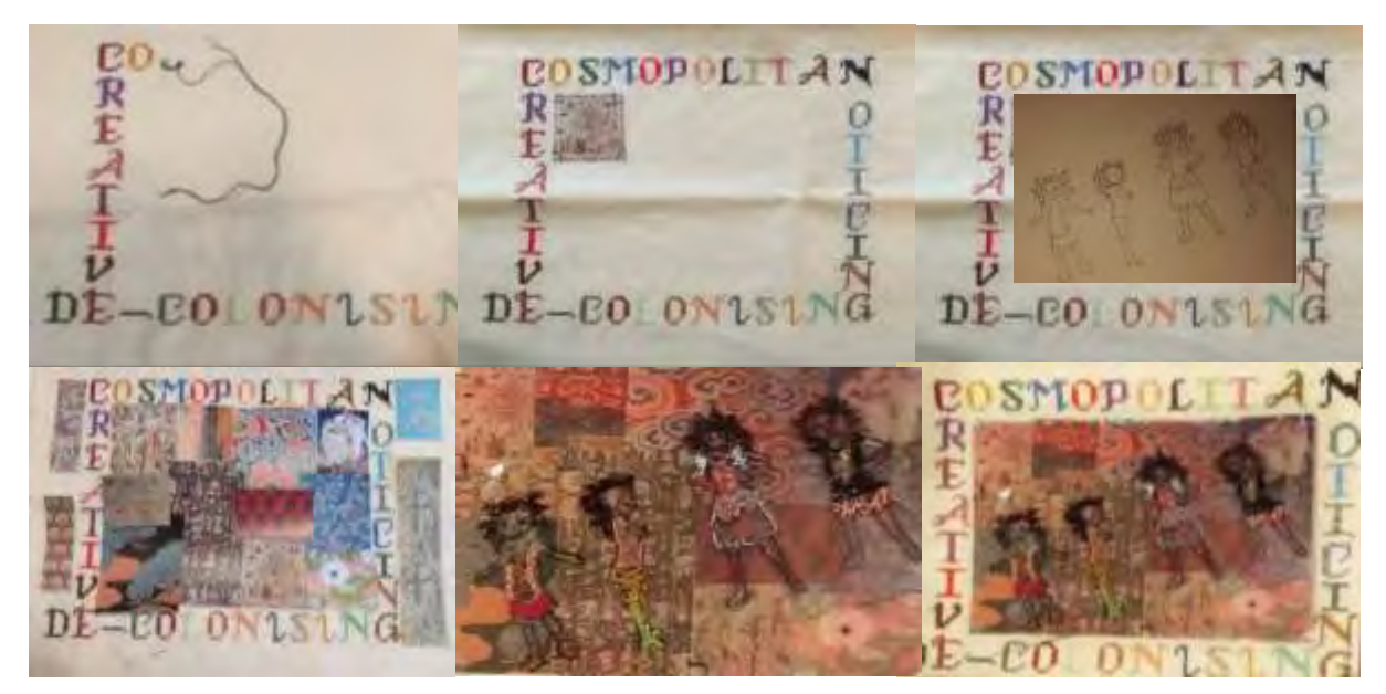
Figure 5: Beverley Hayward, (2021-22) Journal Pages: conceptualisation of ideas and preparation.