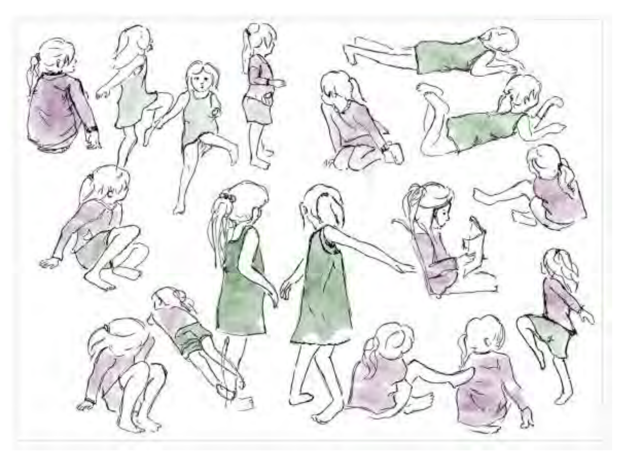
Figure 4: Chrissie Peters, 2015. Amended multicultural illustrated character for children's book, final sketch 3.