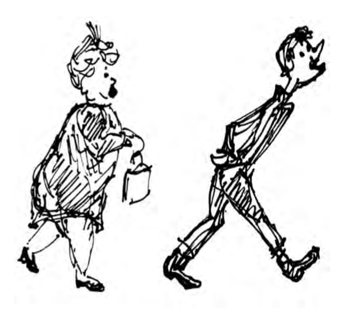
Figures 6 and 7: Chrissie Peters, (2015). Multicultural characters for New Designers.