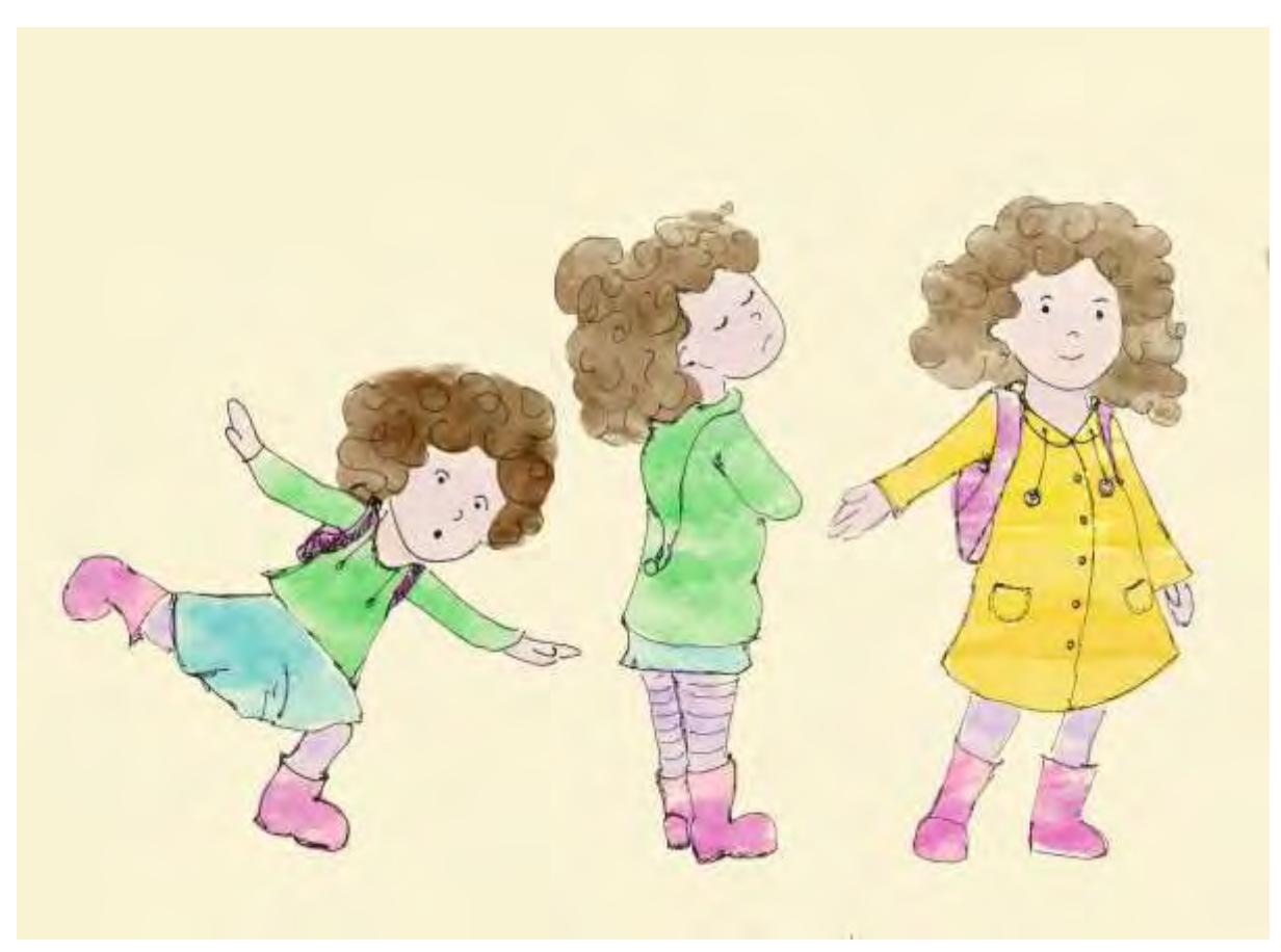
Figure 3: Chrissie Peters, (2015). Amended multicultural illustrated, character for children's book sketch 2.