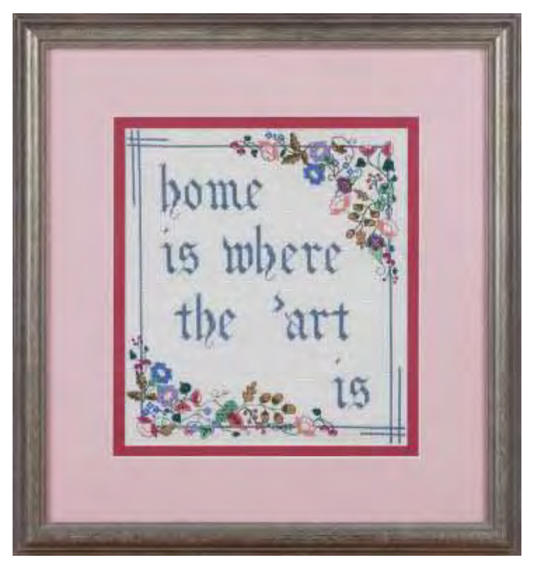
Figure 8: Beverley Hayward, Sewing Sampler: Home Is Where the Art Is, 2014, tapestry, private collection.