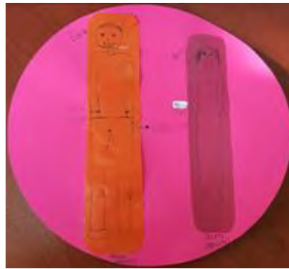
Figure 5. The design of one of the groups regarding the solution

Mert often reminded his students that at the end of the second lesson, they would present their ideas for solutions, the models they constructed and the results they reached to their classmates. These explanations enabled students to reconsider their solution approaches.