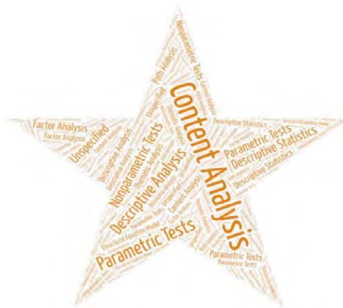
Distribution of Studies Examined According to Data Analysis Methods

As can be seen in Figure 5, content analysis, parametric tests, non-parametric tests and descriptive statistics were frequently used in the analysis of quantitative data of the studies on gifted students in science education. In addition, thematic analysis, structural equation model, path analysis and factor analysis methods were also used. The data analysis method was not specified in 4 journal articles. In one Master's thesis, it was determined that the data analysis method was confused with the research method. The excerpt from the study is as follows.