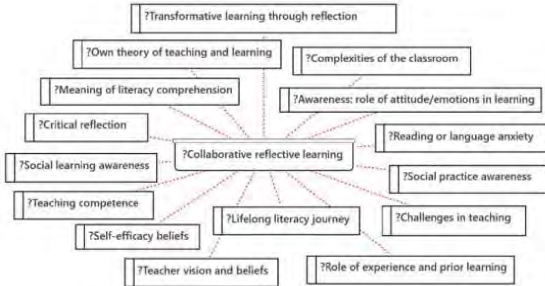
Figure 2: Code network for theme “Collaborative reflective learning.”

The collaboration facilitated reflective learning and created an awareness of the aims and challenges of literacy teaching as well as the role of one’s own knowledge, assumptions, and attitudes, as demonstrated by the code network of this theme: