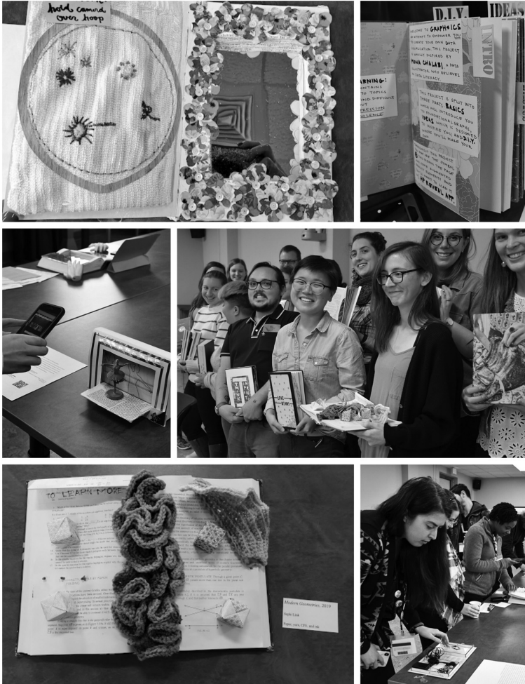
Figure 2: Images of “Bibliocircuitry: Old Books, New Stories” artifacts, showcase, and creators.

constructivism provides an overall model of knowledge acquisition, but it stops short of specifying a particular framework for educational opportunities.