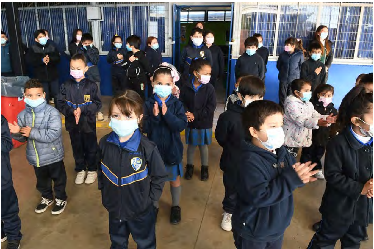
Figure 1 Students at Colegio Reina Norte in Santiago in 2021, after the school reopened