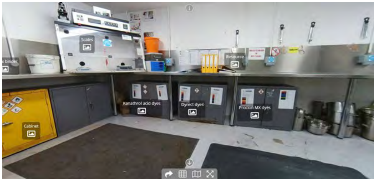
Seekbeak® 360° Room: Washroom in the Art and Design Department

Students were provided with guidance on how to use the Seekbeak® software prior to their EMS audit assessment. Practice versions of virtual rooms were available on the university Virtual Learning Environment to explore the tool, and students were encouraged to discuss their thoughts with their peers and the academic teaching staff both synchronously in live online drop-in sessions and asynchronously using online discussion boards. Students were also given the opportunity to speak to the university's