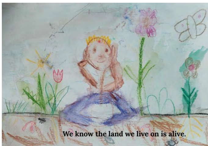
We Know the Land We Live On is Alive