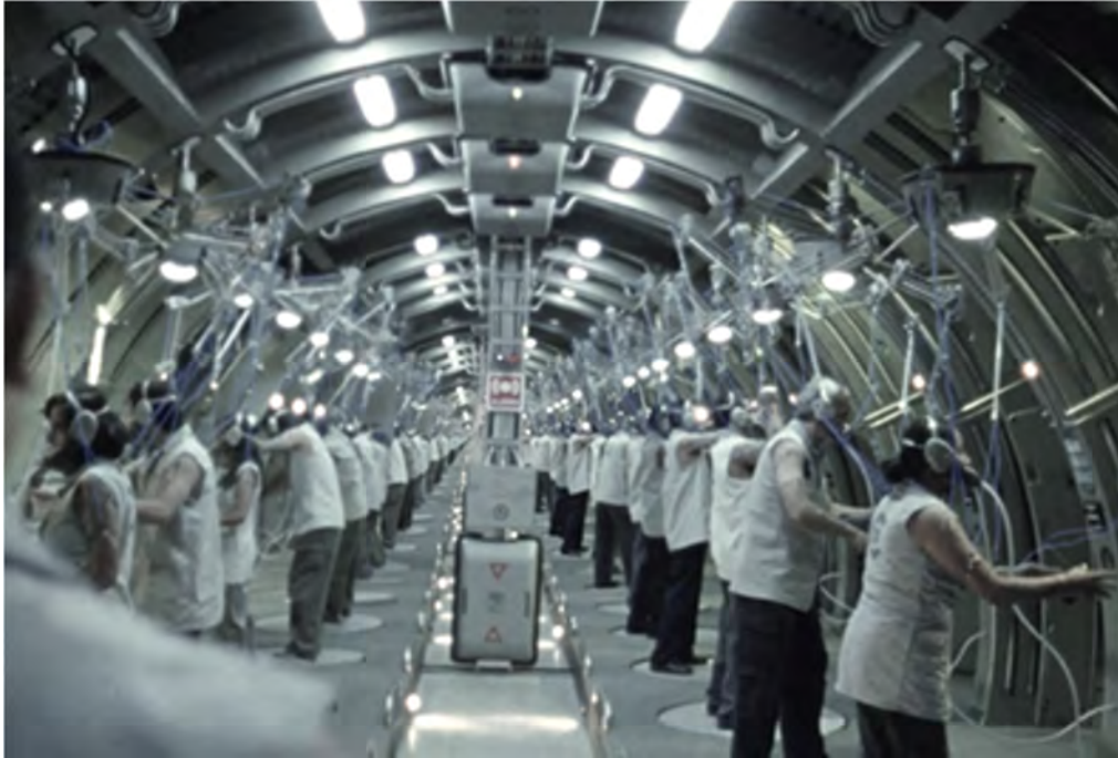
Image of Node Workers in a Factory