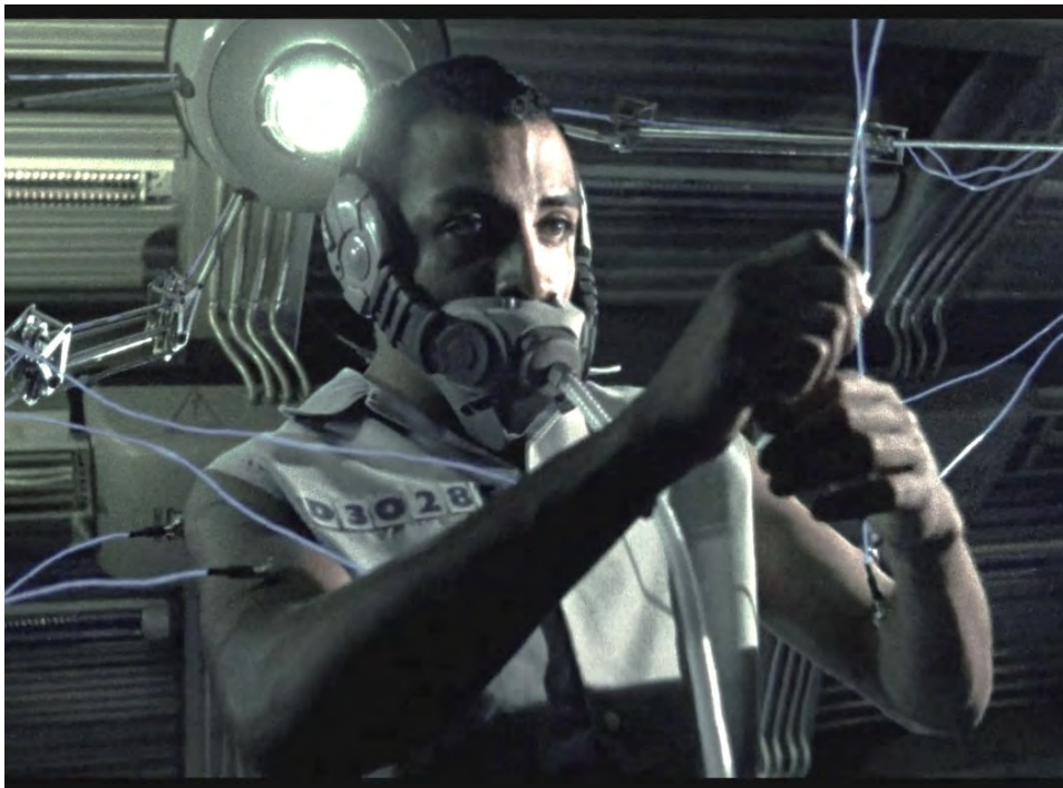
Image of the Main Character Memo as a Node Worker