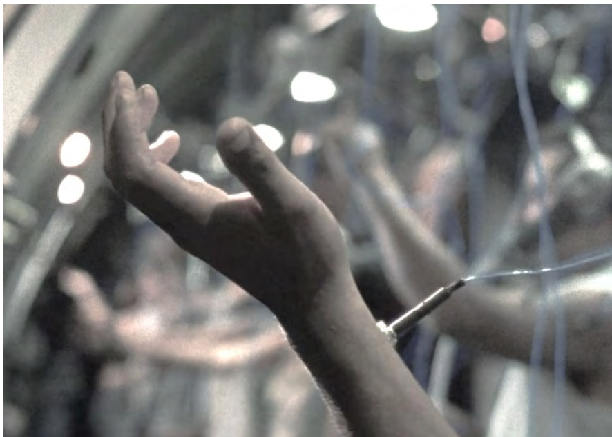
Connecting to the Machine via Nodes

Note. Image from the film Sleep Dealer (Rivera, 2008, 37:29). Copyright 2008 by Alex Rivera. Used with permission.