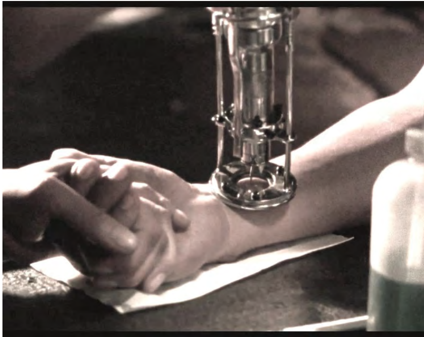
Nodes Being Implanted Into Memo

Note. Image from the film Sleep Dealer (Rivera, 2008, 35:02). Copyright 2008 by Alex Rivera. Used with permission.