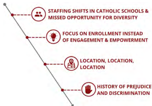
Historical Factors Driving Low Hispanic Educator Representation

Today, 29.1 million Hispanic Catholics (about 47% of all Hispanics self-identify as such) constitute about 41.6% of the nearly 70 million Catholics in the United States ( Smith et al., 2019 ). These numbers suggest that the future of Catholicism in this country will be significantly defined by Hispanics. In 2016, the National Catholic Education Association (NCEA) reported that 7% of all faculty (including full-time and part-time teachers and leaders) in Catholic schools self-identified as Hispanic ( McDonald & Schultz, 2016 ). That percentage increased to 9% (14,612) in the 2020–2021 academic year ( McDonald & Schultz, 2021 ). The Cultivating Talent report provides a closer look at who Hispanic teachers and leaders are in Catholic schools, how they enrich these institutions with their presence and their work, the challenges they face, and how these schools support their flourishing.