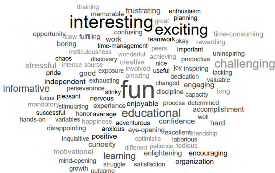
Figure 1. Parent Descriptions of Child's Science Fair Experience

Note. Larger words are those mentioned more frequently.