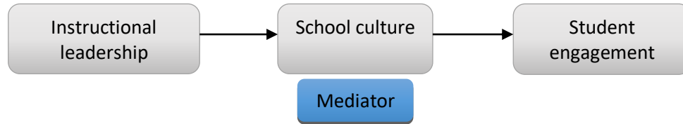
Figure 1. Conceptual framework of the study

Figure 1, shows the Instructional leadership is a predictor variable, while school culture is mediator variable and student engagement is criterion variable. This conceptual framework is based on Mediating-Effect model of leadership.